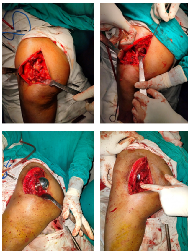
Fig. 3: Surgical Steps