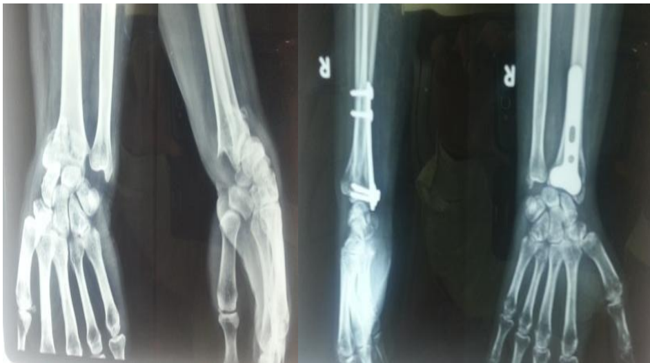
The hand was kept in ulnar deviation and slight flexion.

Volar fragment was reduced using indirect method of reduction by placing a towel beneath and that it self-provided with the traction pull required to reduce the fracture along with a 5mm osteotome under direct vision and a buttress plate was applied to the volar aspect. In few instances the plate had to be bent about 10 degrees, volarward tilting and a short arm splint was applied.