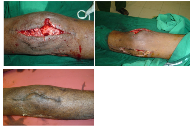
Fig. 4: Showing wound dehiscence following reduction and fixation of fracture patella. Bipedicled flaps raised from both sides to cover the wound and grafts on donor site ensured complete healing

Procedure undertaken: Wound was debrided and cover ensured with an adjacent distally based fasciocutaneous flap based on peroneal artery perforator. The flap had a partial success. Patient was unwilling for any surgical procedure whatsoever while adamant on getting cured.