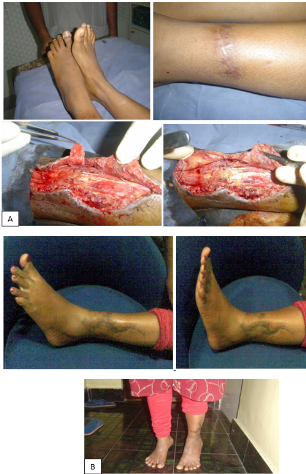
Fig. 3: A): A 15 yrs. old female presents with old injury to lower anterolateral compartment of leg with foot and toe drop. Exploration and repair of tendons were done but closure of wound was difficult with possibility of exposure of repaired site. A small local fasciocutaneous flap was raised to cover the repaired tendons to help loose closure of skin; B): Follow up of healed wound with restoration of ankle and toe dorsiflexion, patient being able to stand on toes

the exposed bone as a cover. It was fixed with 3'0' polyglactin suture. The wound was grafted with complete healing and without any shortening the amputation stump. (Figure 5)