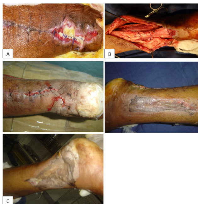
Fig. 1: A): Seventy yrs. old lady presents with multiple comorbidities and exposed Tendo Achilles with slough; B): Wound debridement, fresh repair of remnants of ends of Tendo Achilles, raising of bipedicle flap on lateral side and a perforator (pointed by Adson's forceps) based peninsular flap on medial side; C): Flap sutured in place skin graft applied in donor site

Procedure undertaken: After Debridement, the technique of soft tissue reconstruction involved, raising of bucket handle flaps on one side, a proximally based transposition flap on the other, skin grafting on donor site defects. (Figure 1)