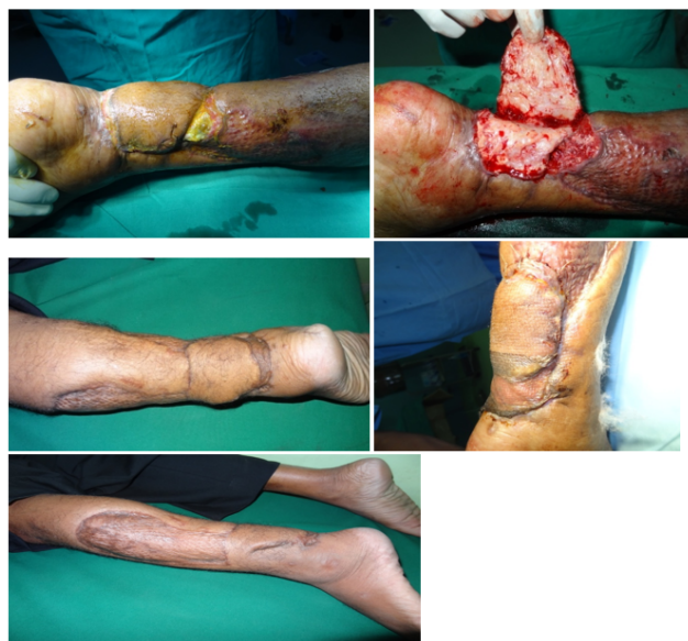
Fig. 2: Showing an existing ulcer over previous repair of Tendo Achilles reconstructed by a distally based fasciocutaneous flap. The flap was split, skin and a partial layer of subcutaneous tissue raised and used to cover the defect. The donor site is skin grafted followed by complete healing

Case 3: A girl of 15 yrs. sustained an injury in the anterolateral compartment of leg about 6 months back. Now she presented with a healed skin wound, ankle and toe drop.