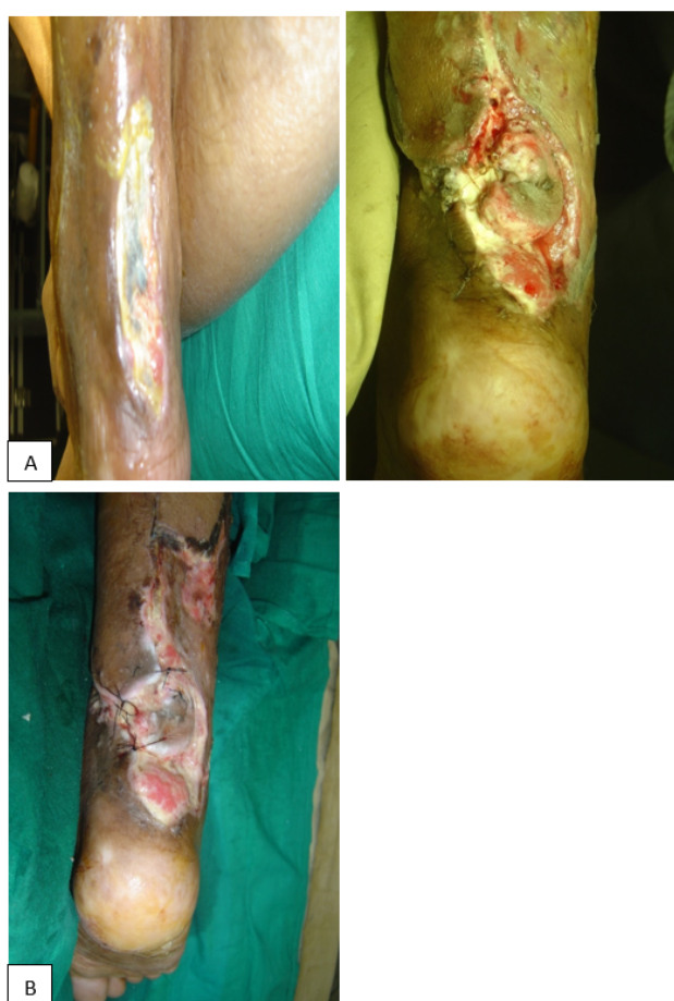
Fig. 6: A): 68 yrs. old male patient with multiple comorbidities and irregular treatment presents with eschar and over Tendo Achilles following an old injury. Debridement and a distally based fasciocutaneous flap met with partial success with areas of exposure still present

surgical cover. 3,4 Microvascular free flaps, fasciocutaneous flaps, perforator based flaps, with additional skin grafts are the usual procedures. 5–7 Many elderly patients are further handicapped by presence of comorbidities like Diabetes mellitus, Hypertension, Hyperlipidaemia, Hyperuricemia and local vascular problem. These simple tricky surgeries help a great deal when operating in smaller setups with limited resources or when disappointed patient and family do not consent for performing another complex operation. Tissue edema and configuration of the repair prevented an ideal closure resulting in exposure of the site of repair, in case 3. To circumvent the problem, a small local fascial flap was raised and transposed to cover the repair site. This helped to close the wound loosely keeping a small area even partially exposed. The wound healed primarily with full functional recovery. (Figure 3)