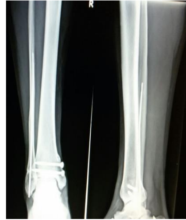
9 month follow up Radiograph