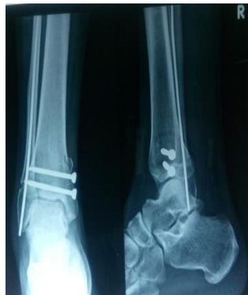
6 month follow up Radiograph