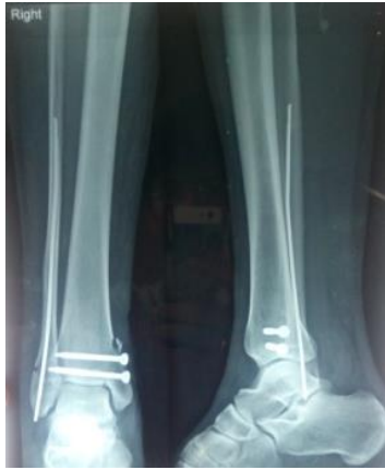
Immediate Post-operative Radiograph