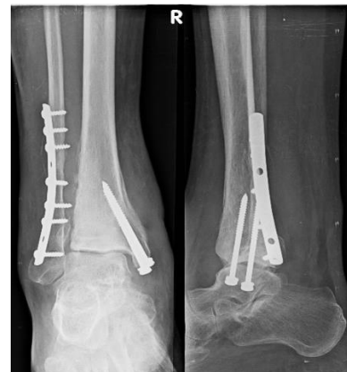
Nine month Follow-up Radiograph