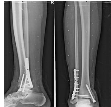
Immediate post-operative radiograph showing medial malleolar Screw with 1/3 semi tubular fibular plate and syndenmotic screw