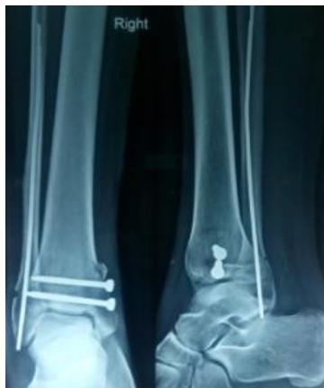
1 month follow up Radiograph