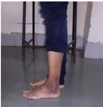
Full Weight bearing without support