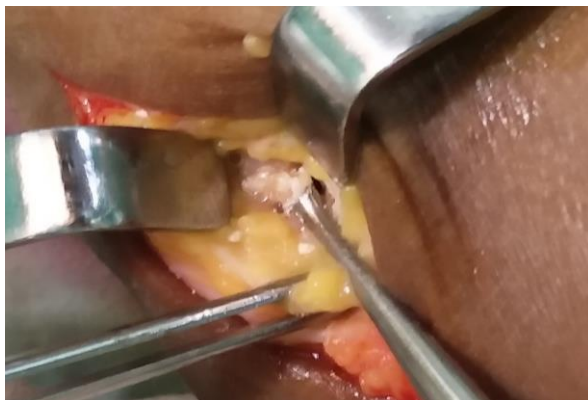
Fig. 3: Intraoperative soft tissue being secured for biopsy