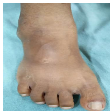
Fig. 1: Clinical picture showing diffuse swelling in midfoot region

subsidence in the pain and swelling, suggesting correct diagnosis and treatment.