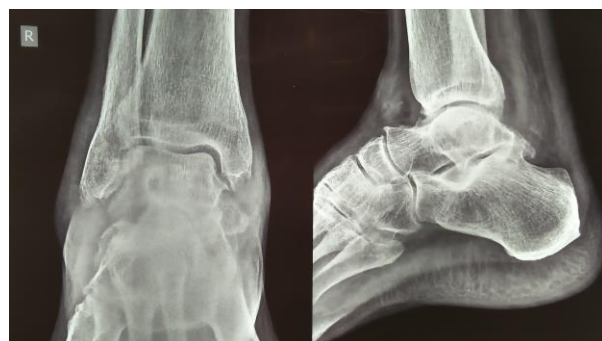
Fig. 2: Ankle plain radiograph showing arthritic changes