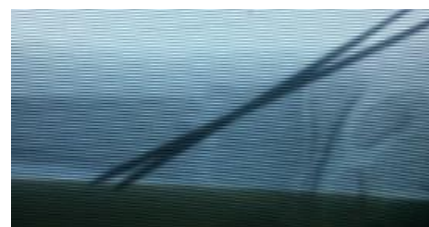
Final AP view