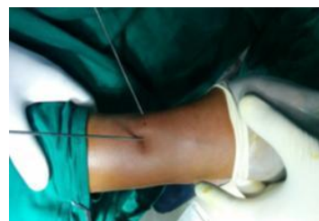
Intra focal pinning clinical