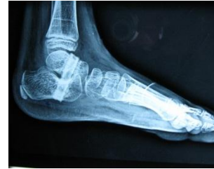
Fig. 7: Post-operative radiograph: graft in position with extra articular sub-talar joint fusion