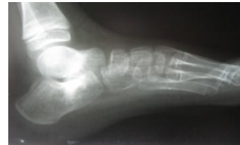
Fig. 8: Radiograph showing graft resorption