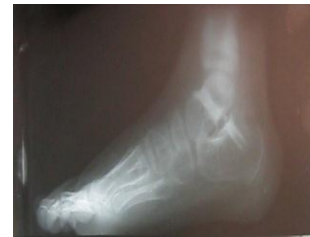
Fig. 9: Radiograph showing graft fracture