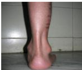
Fig. 6: Post-operative photograph