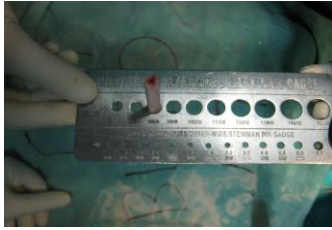
Fig. 1: Measuring diameter of fibular graft