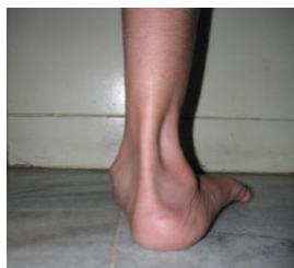
Fig. 5: Pre-op photograph