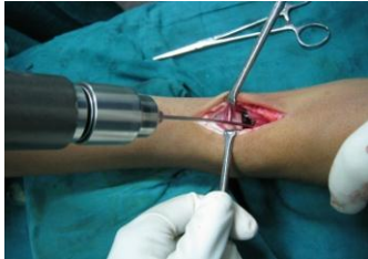
Fig. 2: K-wire passed through neck of the talus into the calcaneum