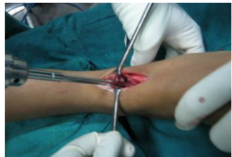
Fig. 3: Serial reaming to accommodate the fibular graft