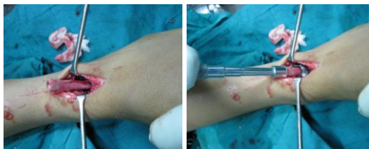
Fig. 4: Insertion of fibular graft through talar neck into the calcaneum