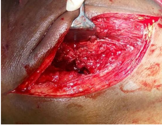
Fig. 1: Exposure of the hip joint after cutting the capsule