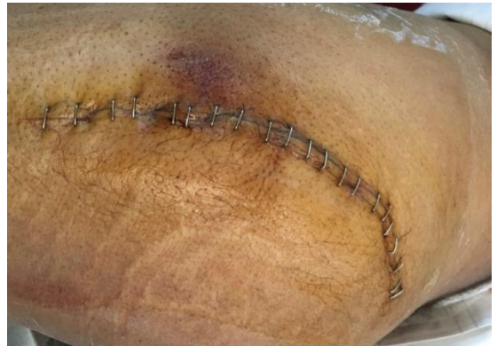
Fig. 5: Wound without closed suction drain