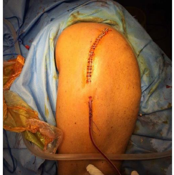
Fig. 4: Wound with closed suction drain