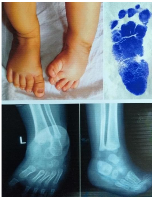
Fig. 3: Illustrated case pre-treatment