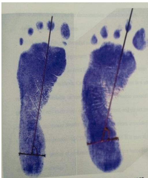
Fig. 1: Podogrammic Evaluation: Foot Bimalleolar Angle (FBA) in normal and clubfoot

The mean initial Pirani score (PSi) was 3.86 which improved to final score (PSf) of 0.13. The Pirani score after 3 months of follow-up (PS3m) was 0.31 because of relapse in 16 cases. With treatment, Pirani score after 6 months (PS6m) again improved to 0.27.