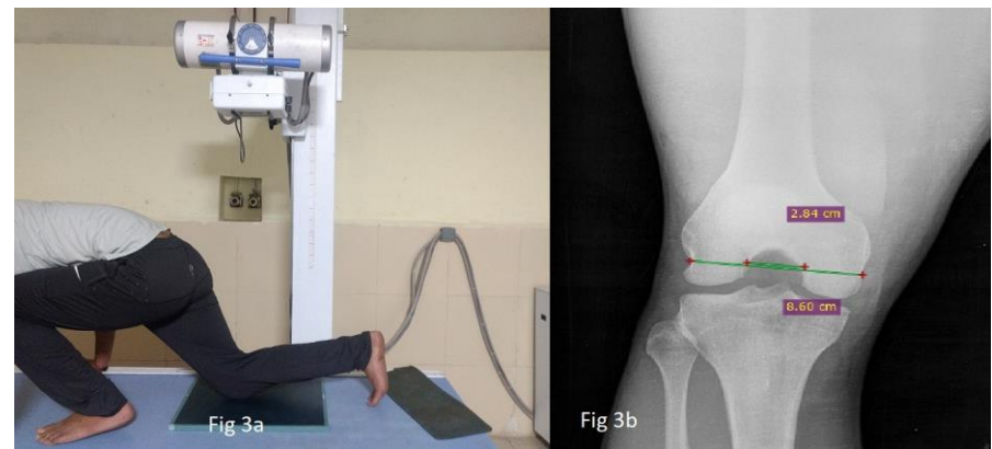
Fig. 3a): Position of the patient while taking tunnel view of knee joint; b): showing reference landmarks for calculation of femoral width and notch width