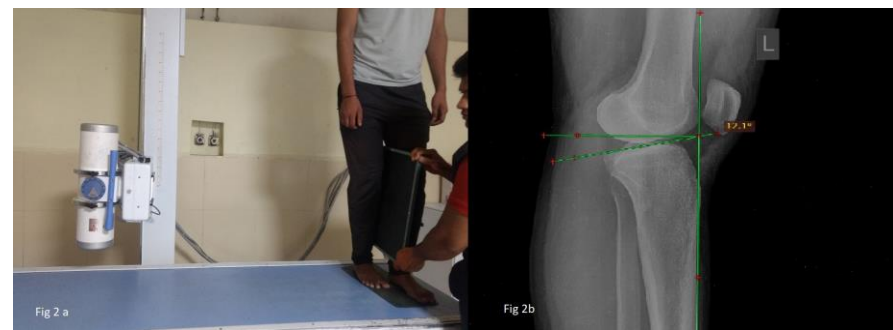
Fig. 2a): Position of the patient while taking lateral radiograph of the knee; b): Showing reference landmarks for measuring posterior tibial slope