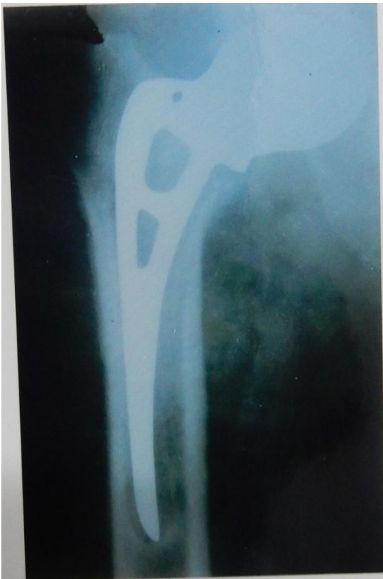
LOSSENING OF STEM