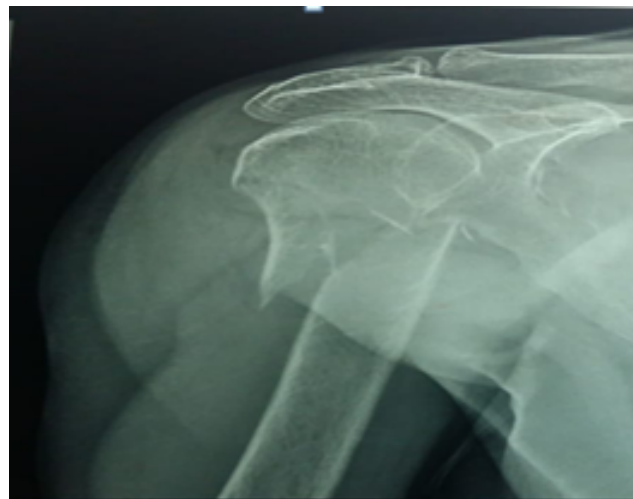
Fig. 1: Pre-operative x-ray

assess for union or any complication mentioned above. Callus formation, presence of bridging osseous trabeculae and cortical continuity were considered as evidence of radiological union. Humeral head-shaft angle is the angle between humeral shaft axis and head. Head axis was taken as perpendicular to a line between the nearest lateral and medial points of the anatomic neck through the apex of the head. Head-shaft angle was further categorized as major varus (115 degrees), minor varus (115–124 degrees), normal (125–145 degrees), minor valgus (146–155 degrees), and major valgus (155 degrees) and compared between the immediate postoperative and last follow-up radiographs.