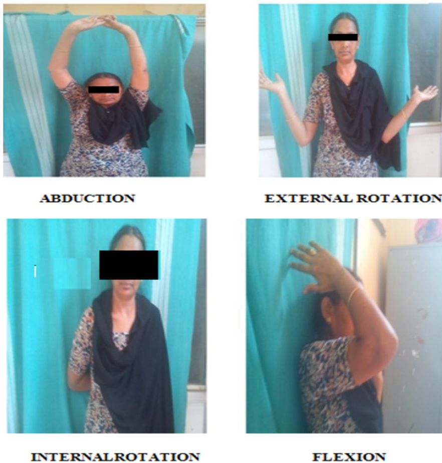
Fig. 4: Functional outcome