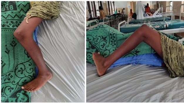
Fig. 1: Pre op clinical photographs of the patient