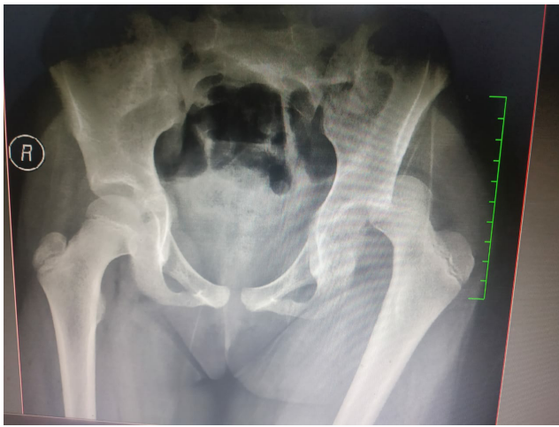
Fig. 2: Pre operative radiograph of the pelvis with both hips in anteroposterior view suggestive of left hip posterior dislocation

Post-traumatic hip dislocations in adults and children are commonly posterior, more commonly in males than females. 5 The classic clinical picture on presentation is of a shortened limb with the hip flexed, adducted, and internally rotated. On occasion, the patient can also present with isolated knee pain, referred from the involved hip. 6,7