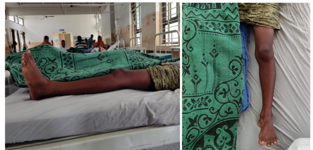
Fig. 4: Post operative clinical photographs

The significance of early reduction is demonstrated by studies that recorded the incidence of AVN rises to over 65%, from the average of 8-10%, if the reduction is delayed beyond 24 hours after a dislocation. 7,9 The classic report by Mehlman et al. concluded that patients whose hips were reduced beyond the golden period had a twenty times increase in the risk of developing AVN. Moreover, AVN may develop up to three years following injury. 6 Delays in diagnosis are commonly encountered not only due to the rare occurrence of the case and minimal Velocity of trauma but also due to associated injuries that may lead to neglecting the hip injury. 5,10 Several reports suggest a direct relation between AVN and time to reduction rather than with time to weight-bearing. It is important to note that a reduction within the golden period does not necessarily exclude the risk of avascular necrosis. 6