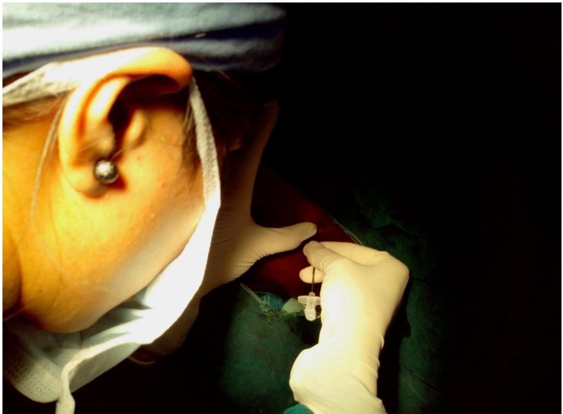
Identification of epidural space