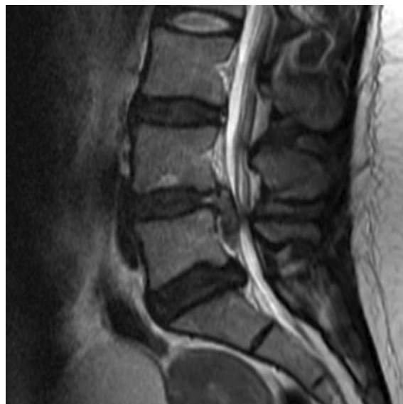
MRI of disc extrusion at T2 level