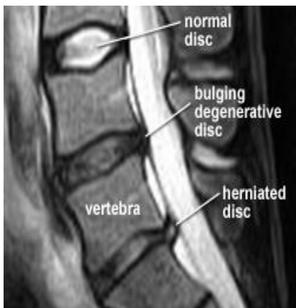
MRI of disc prolapsed

From the above results we find that the effect of epidural steroid injection decreases with time. There are several factors for varied results like patient selection, patient’s individual interpretation of level of pain, regular follow up and the degree up to which patient follows post injection advice of doctors. The local effect of steroids has been shown to last at least 2 to 3 weeks at a therapeutic level. This therapeutic decay prompted many physicians to recommend multiple injections. 7 The acceptable time interval between two injections is still debatable but some studies have shown that 7-10 days interval is appropriate. 8 Only few of our patients reported with local pain over the injection site and headache, which subsided with conservative treatment. There have been reports of epidural abscess, epidural hematoma, and duro-cutaneous fistula, bacterial meningitis and post-dural puncture headache. 9,10 None of these were seen in our study.