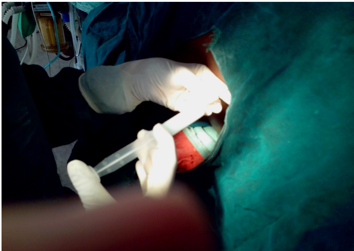
Injecting the mixture of methyl prednisolone, bupivacaine and normal saline.