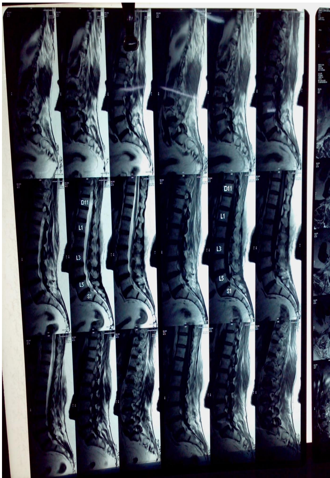
MRI showing at L4L5 level mild diffuse disc bulge indenting on ventral aspect of the cal sac and at L5S1 level posterior tear with diffuse asymmetrical disc bulge