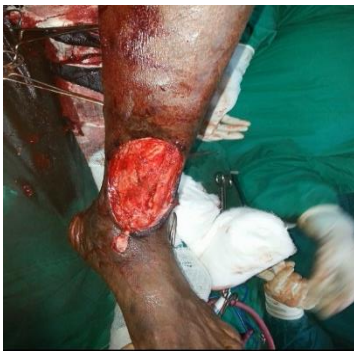
Fig. 8(a): Post trauma wound left leg