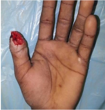
Fig. 7(a): Post trauma wound thumb