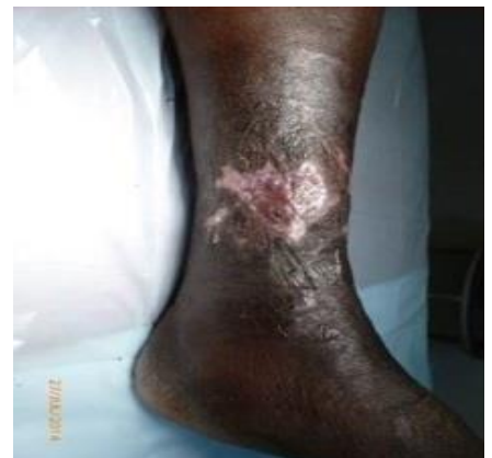
Fig. 6(c): After wound reconstructed with split thickness skin grafting.