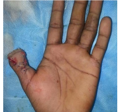
Figure 7(c): After flap cover