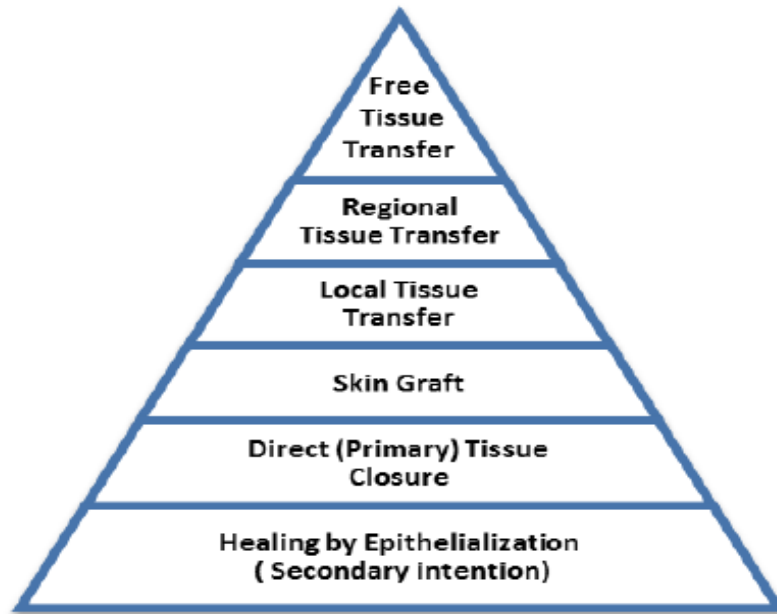
Fig. 5: Ladder of Reconstruction.