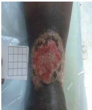
Fig. 6(a): Before RF Debridement.