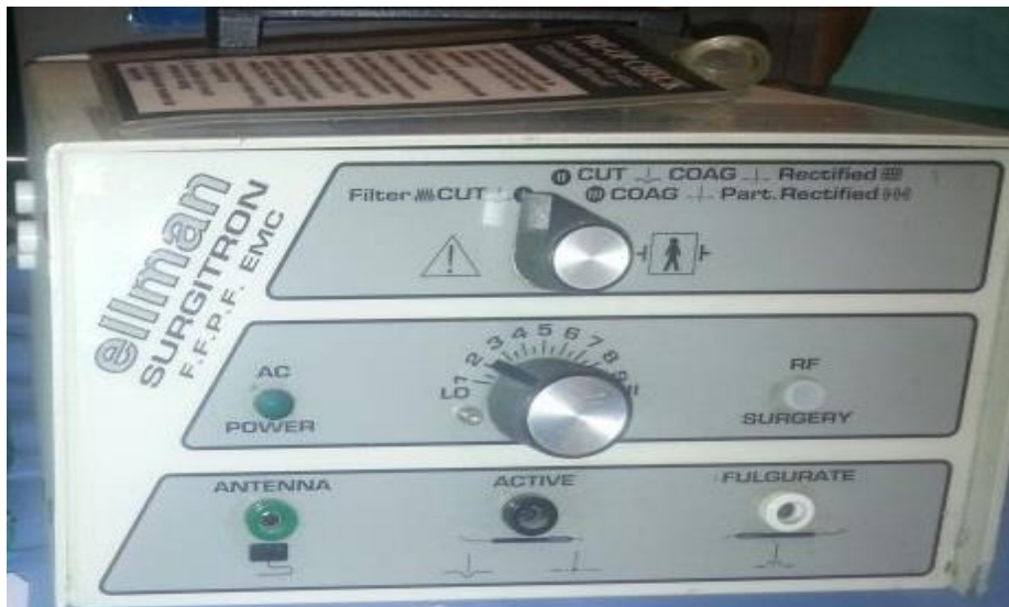
Fig. 1: Ellman Surgitron F.F.P.F. EMC™ Radio Frequency machine