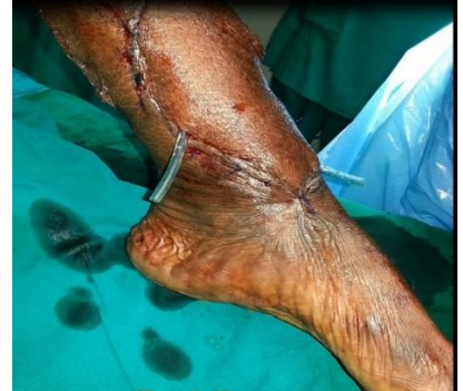
Fig. 8(c): After flap cover