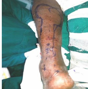
Fig. 8b. After RF debridement, wound bed stimulation planned for pedicle reverse sural flap cover