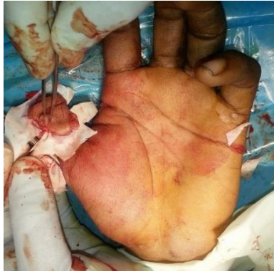
Fig. 7(b): After RF debridement and flap raised