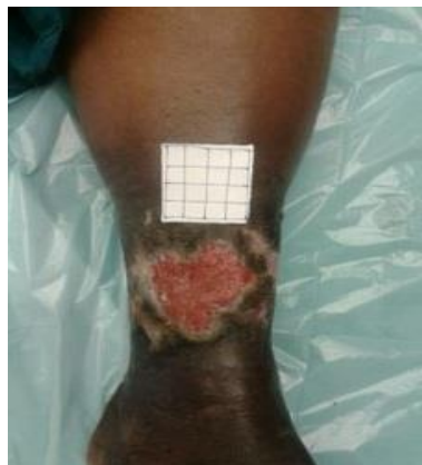
Fig. 6(b): After RF debridement and wound bed stimulation.