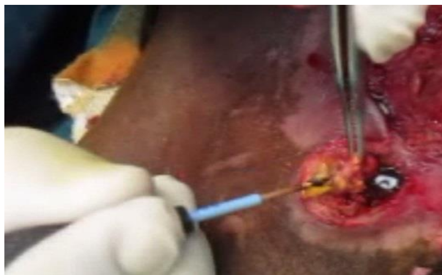
Fig. 3: Debridement with RF probe while holding the of necrotic tissue with toothed forceps