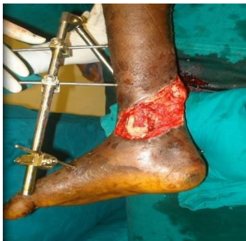
Fig. 9(a): Post trauma Wound Right leg after RF debridement and wound bed stimulation.