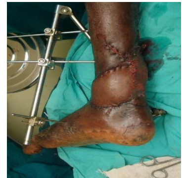
Fig. 9(c): After free ALT flap cover.