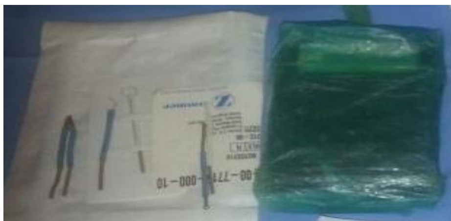
Fig. 2: Different RF probes and foot switch