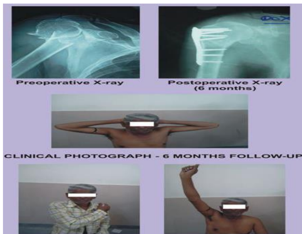
Fig. 1: Clinical and X-ray pictures of open reduction and internal fixation with PHILOS.

a. 0 cells (0.0%) have expected count less than 5. The minimum expected count is 5.70.