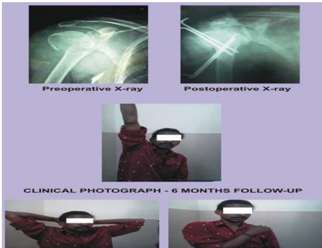
Fig. 2: Clinical and X-ray pictures of closed reduction and percutaneous K wire fixation.