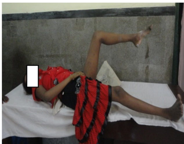
Fig. 7: Case 1 : Clinical photograph postoperative at 20 weeks