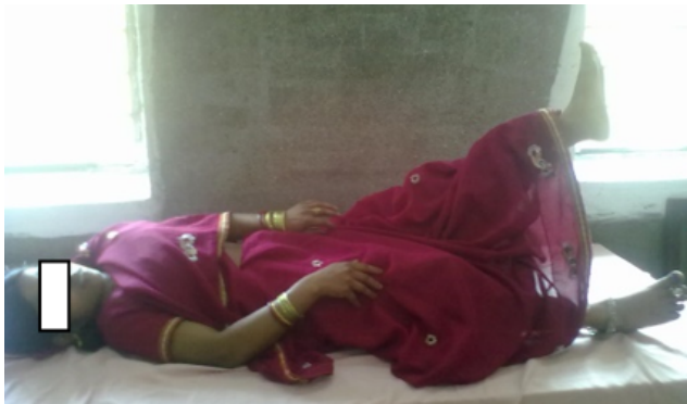
Fig. 12: Case 2: Clinical photograph