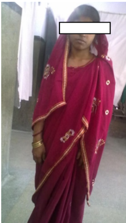
Fig. 13: Case 2: Clinical photograph