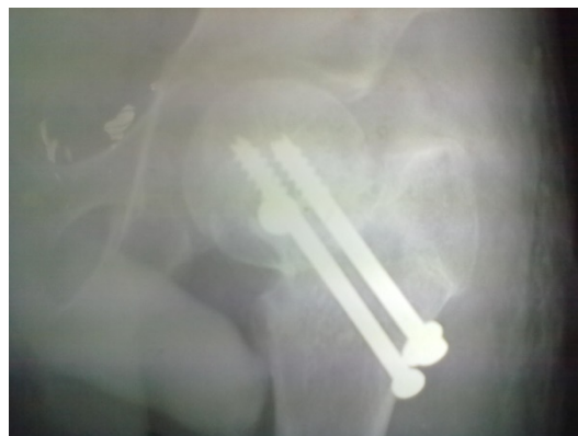
Fig. 10: Case 2: Postoperative at 10 weeks