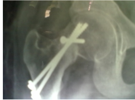
Fig. 3: Case 1: Postoperative x-ray at 10 week AP view