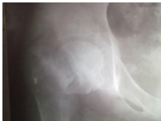
Fig. 9: Case 2: Preoperative x-ray