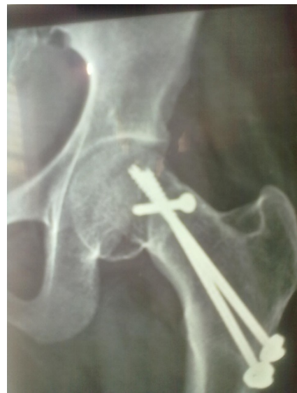
Fig. 5: Case 1: Postoperative at 16 weeks