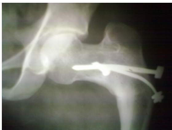
Fig. 16: Case 4: Coxa vara with bending of implant

Harun Yasin Tuzun et al. in his series of 16 patients has reported radiological union at average of 7 months and only one patient (6%) had avascular necrosis. 6