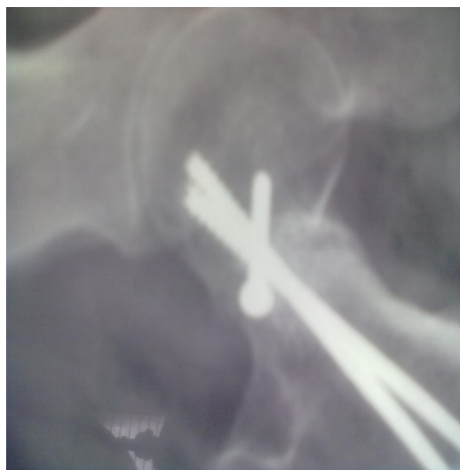
Fig. 2: Case 1: Postoperative at 6 weeks