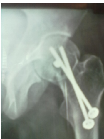
Fig. 6: Case 1: Postoperative at 20 weeks