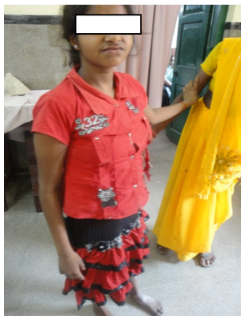
Fig. 8: Case 1: Clinical photograph at 20 weeks postoperative