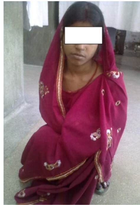
Fig. 14: Case 2 : Clinical photograph