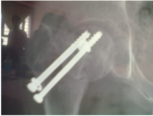
Fig. 11: case 2: Postoperative x-ray at 16 weeks