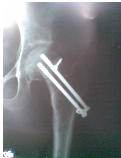
Fig. 15: Case 3: Postoperative X-ray