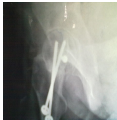
Fig. 4: Case 1: Postoperative x-ray at 10 week lateral view