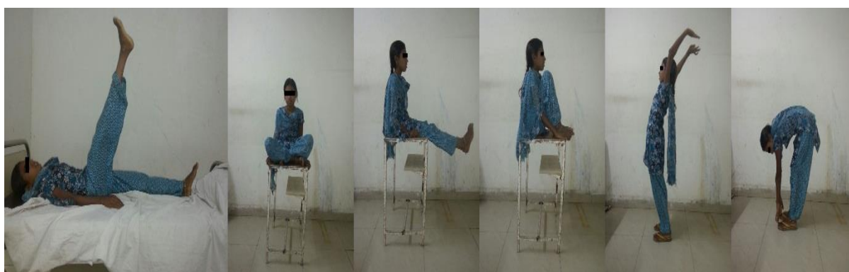
Fig. 6: Clinical Images at 1 year follow-up