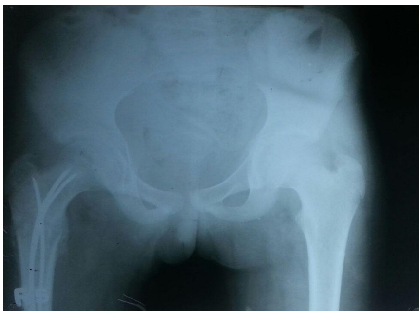
Fig. 4: Post-operative x-ray at 2 months of pelvis with both hip showing good callus formation with 3 TENS nails in place