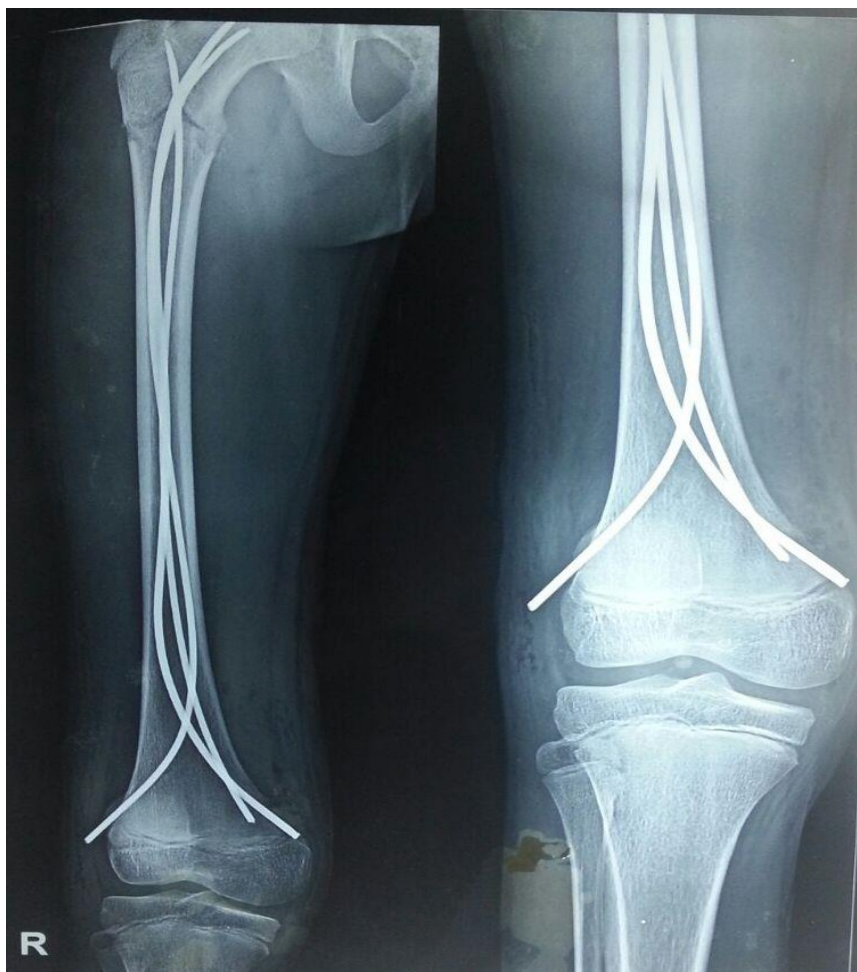
Fig. 3: Immediate post-operative x-ray of right hip with thigh showing sub trochanteric femur fracture fixed with 3 TENS nails