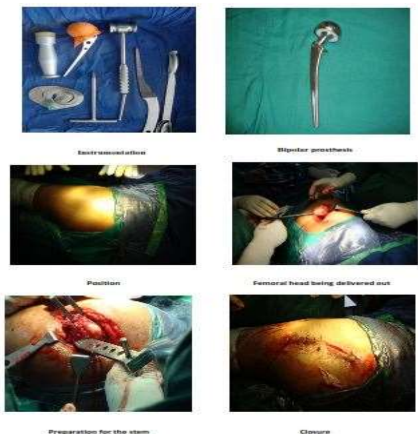
Fig. 1: Intraoperative Pictures

Injection Enoxaparin 40milligramsubcutaneously 12 hours after surgery and once a day for seven days 9 . All the patients were started with quadriceps strengthening exercises from day two and high sitting from day three. The patients treated with cemented bipolar prosthesis were allowed for full weight bearing from fifth post-operative day. This early weight bearing was allowed because of the stability of the implant achieved by the cement. The patients treated with Austin Moore's prosthesis were allowed for non-weight bearing ambulation with the help of walker for first three weeks, partial weight bearing till six weeks and followed by full weight bearing. This delayed weight bearing allows bone growth on the surface and holes of prosthesis which helps in stability 10 .