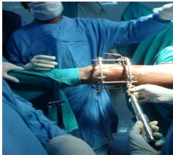
Fig.: Tensioning the wire