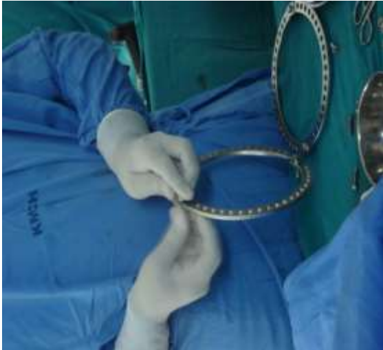
Fig.: Assemblage of the ring and draped