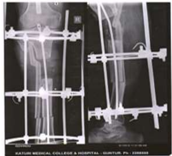
Fig. 2: Post-operative radiograph after sequestrectomy and distal corticotomy with ilizarov fixator