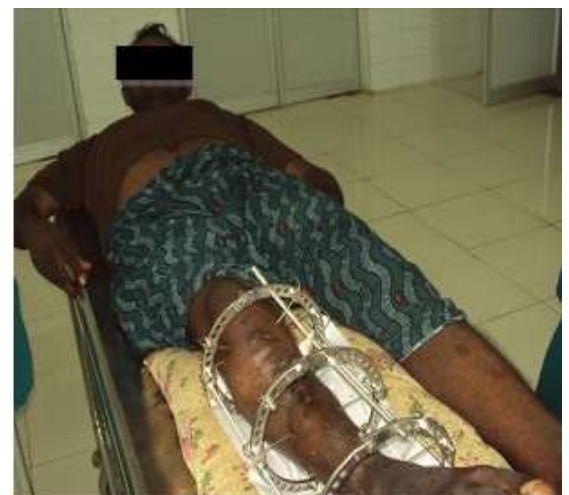
Fig. 3: Postoperative clinical photograph