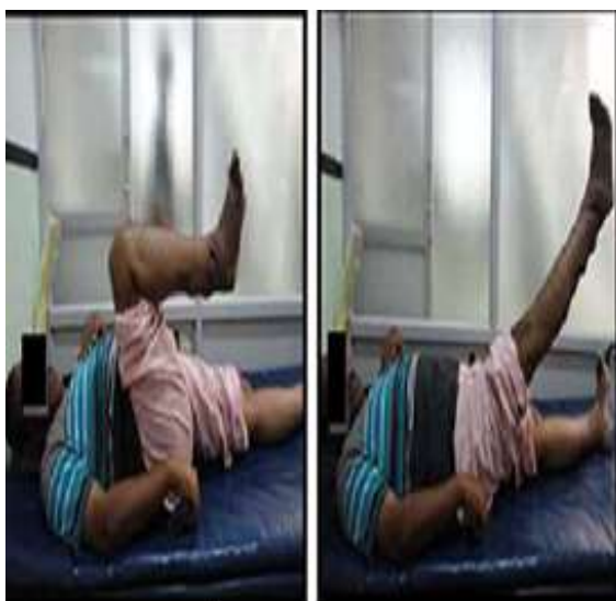
Fig. 5: Functional outcome at 10 months post OP