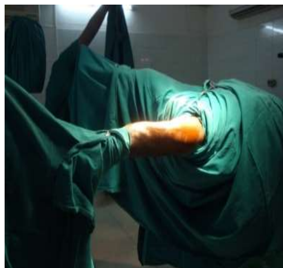
Fig.: Positioned in traction table

Latency period of 4 to 15 days was used rate of distraction was fixed at 1mm/day or sometimes altered depending on follow up x-rays. Follow up were done at monthly intervals. Frame removal done when the union was sound clinically and radiological lying confirmed. Fixator was dynamized before removal towards the end of the treatment. After removal patients were given functional brace for 6 weeks.