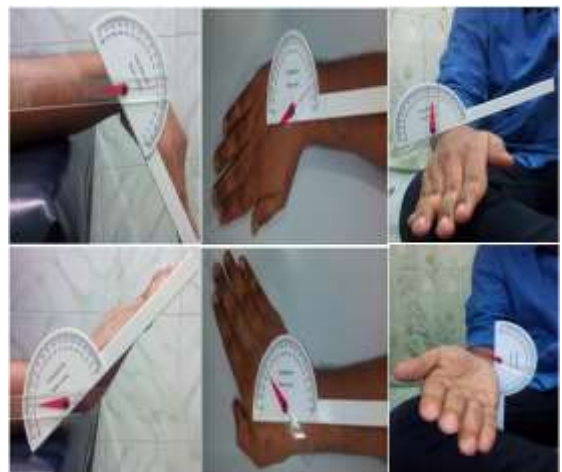
Fig. 3: Wrist ROM for the similar patient showing good ROM score of 22 out of 26

Also we found dorsal tilt has great impact on functional objective outcome and should be restored adequately, the similar results were shown by the study conducted by Forward et al 18 ; but there is no relation with radial inclination.