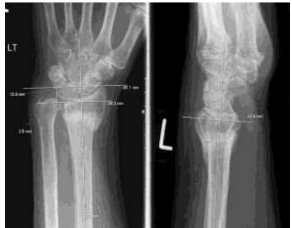
Fig. 2: AP and Lateral x-ray of malunited fracture showing radiological parameters of 61 year old patient

that the anatomical restoration results in better functional outcome in young groups, but not in older age group patients.