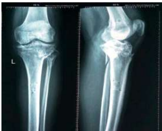
Fig. 3: Post-operative X-ray after five months