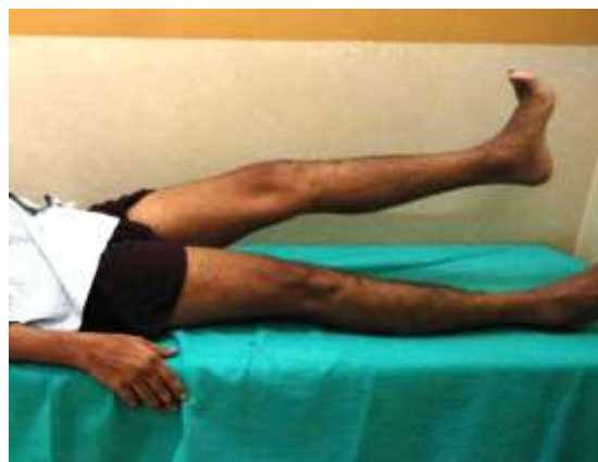
Fig. 5: Range of movements of the knee joint