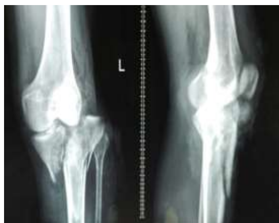
Fig. 1: Pre-operative X-ray of the knee joint

The patients were followed up for a minimum period of eight months. The average range of movements achieved in the knee joint was 105 degrees at the end of eight months. Complications included knee stiffness and pin site infections. Knee stiffness was managed by subjecting the patient to aggressive physiotherapy by continuous passive movements. In one patient manipulation under general anesthesia had to be done. Two patients had pin site infections which were superficial and subsided by antibiotics and daily pin site dressings. The knee society score was excellent in four patients and good in one patient.