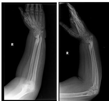
Fig. 1: Pre-Op Xrays

There was non-union of the radius with loss of height for which shortening of the Ulna was done and plating was done