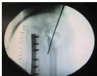
Fig. 2: Intra-Op Photos

Allograft placed in the recipient site and held in position with K-wires