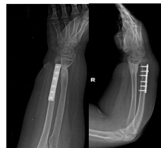
Fig. 3: One Year Follow Up, Post-Op X-Rays

Allograft placed in the recipient site and held in position with K-wires