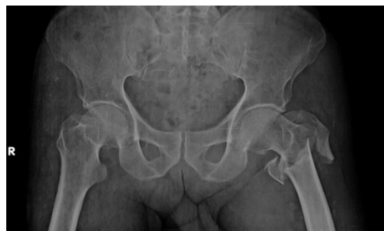
Fig. 1: Pre-operative

the severity of trauma. The patients were then assessed clinically and haematological investigations along with radiographs of the affected hip joint including opposite hip and pelvis were taken in antero-posterior and lateral views (Fig. 1). Well written prior informed consent was taken pre-operatively from all the patients. Prior ethical committee approval was obtained before commencing the study.