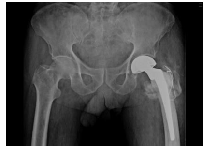
Fig. 4: Follow-up at 24 months

227.5ml of blood loss intra-operatively. Intra-operative blood was measured with the help of blood collected in the mobs used during the surgery. The average duration of stay in hospital was 8.4 \pm 1.68 days. 0.5cm shortening was encountered in two patients in the present study. Final results were calculated using the Harris Hip score (Table 1). 14 (32.5%) patients had excellent, 23 (53.4%) had good, 4 (9.4%) had fair and 2 (4.7%) patients had poor results respectively (Table 2). Regular follow-up was done at 1, 3, 6, 12 and 24 months (Fig. 4).