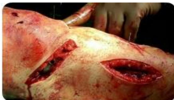
Lateral Side of Upper Tibia

Elevation of depressed fragments of articular surface done by the punch and mallet under guidance of image intensifier after making of cortical window on the affected side and fixed it with subchondral k wires initially. Bone grafting at empty space below the depressed segment was done in 3 cases after taking graft from iliac crest. Medial anatomical pre-contoured locked plate was secured using locking screw (Fig. 3). Laterally also anatomical pre-contour were inserted percutaneously to secure lateral tibial plateau fixation with 6.5 mm fully threaded cancellous screw in metaphyseal region and cortical screw in diaphyseal region of tibia.