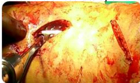
Medial Side of Upper Tibia