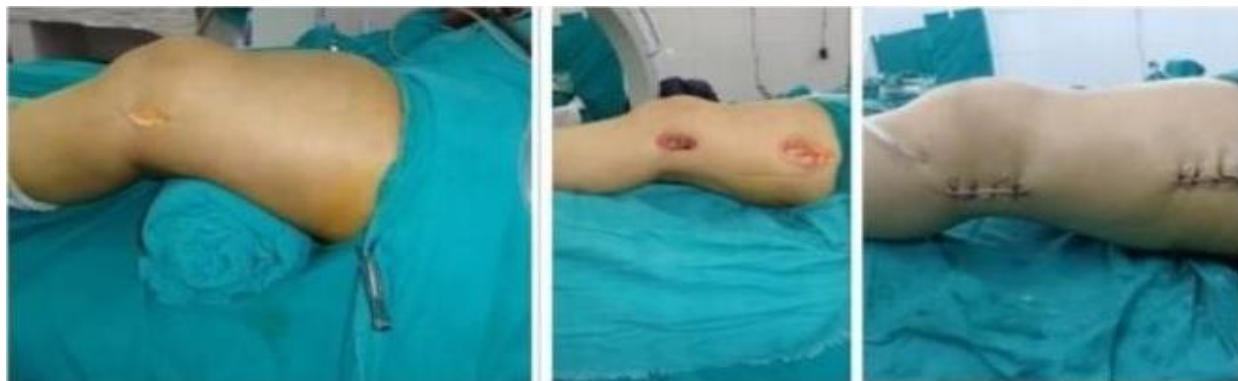
Intraoperative positioning, Incision Placement

Post operatively, all the patients were followed up for every 6 weeks till union, thereafter for every 3 months upto 1 year and then for every 6 months.