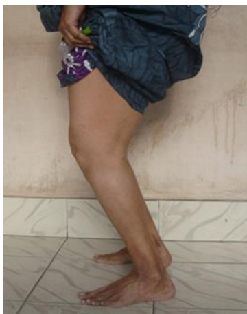
Fig. 10: photos showing severe fixed flexion deformity of both knee in 55 years old patient