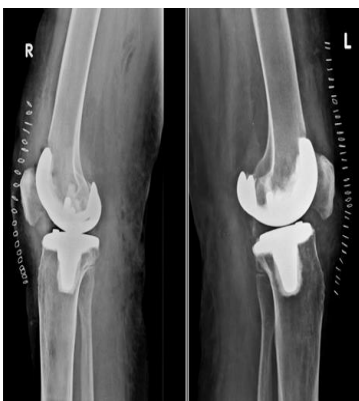
Fig. 5: Radiographs of both Knee immediate post-operative- lateral view showing Implant in situ