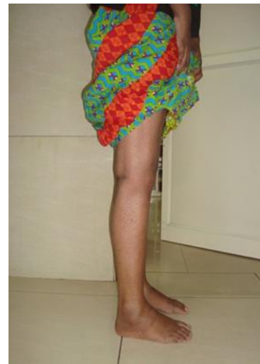
Fig. 8: Photos of a patient showing fully corrected FFD at one year follow up