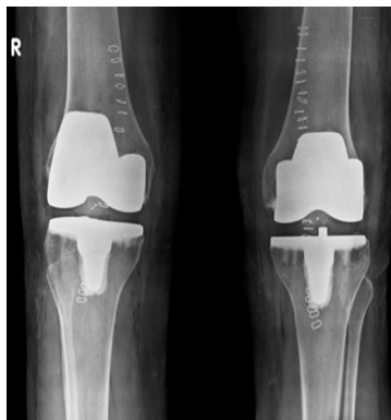
Fig. 4: Radiographs of both Knee immediate post-operative- AP view showing Implant in situ