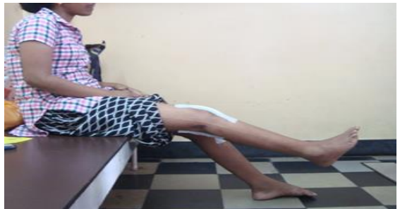
Fig. 7: Clinical Photos of a patient showing residual FFD in right knee at 2 weeks of follow up