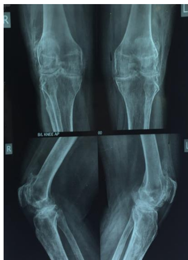
Fig. 11: Radiographs of Knee AP/LAT showing concentric narrowing of joint space, osteopenia and osteophytes involving all three compartment of knee in known case of RA