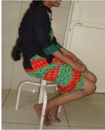
Fig. 9: Photos of a patient showing flexion of both knee at one year follow up Case 2