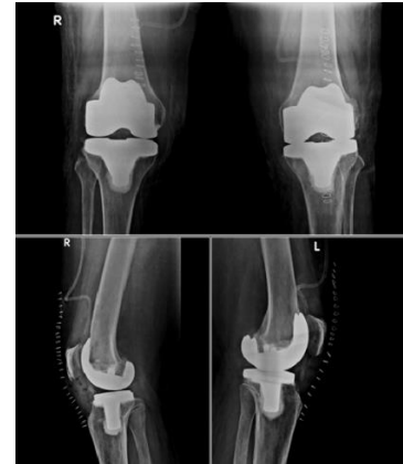
Fig. 12: Radiographs of both Knee immediate post-operative– AP and Lat view showing Implant in situ