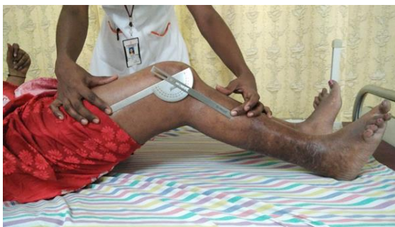
Fig. 1: Photo showing measurement of FFD by goniometer with one limb of goniometer along the long axis of tibia and another limb along long axis of femur directed towards greater trochanter

We recorded the preoperative ROM, KSS-Pain and functional score of all patients; all patients were evaluated with radiographs of knee AP/lateral and whole leg (if patients were able to stand). Clinical measurement of FFD was done with goniometer one limb of goniometer along the long axis of tibia and another limb along long axis of femur directed towards greater trochanter (Fig. 1). All patients were started on preoperative physiotherapy for at least of 4 weeks (average 6 weeks), all the cases were operated by single surgeon with MBK (Mobile bearing knee) or FBK (Fixed bearing knee) and data was recorded at follow up at 6 weeks, 12 weeks, 6 months and then yearly. At every follow up, patient's KSS(Pain and functional score) were recorded.