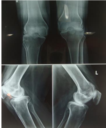
Fig. 3: Radiographs of Knee AP/LAT showing concentric narrowing of joint space known case of RA