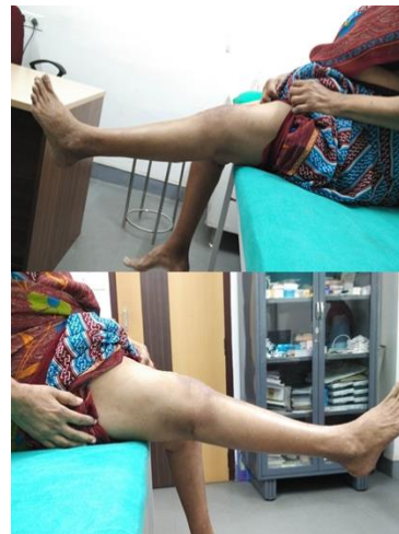
Fig. 13: Clinical Photos of a patient showing fully corrected FFD at one year follow up