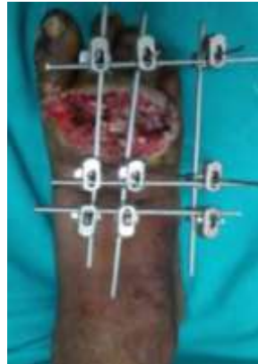
(E) Wound at 04 th day