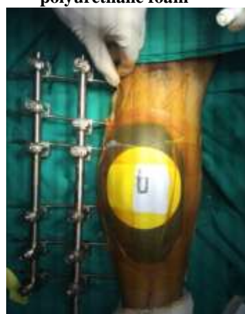
(E) Sealing of connecting clamp with adhesive drape