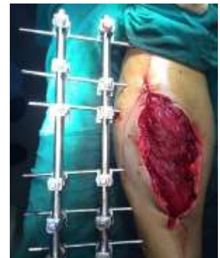
(C) Wound after Debridement