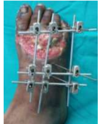
(F) Wound at 08 th day