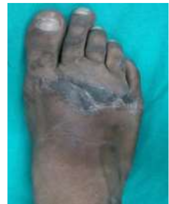
(I) 06 Months final follow up