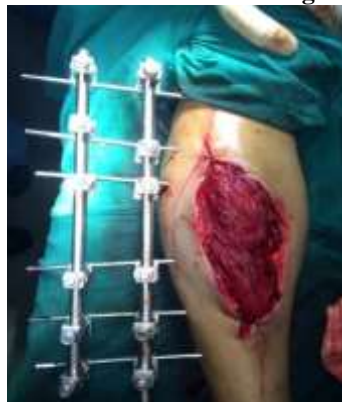
(A) Prepared wound bed