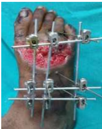
(G) Wound at 12 th Day