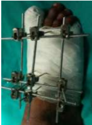
(D) With standard wound dressing