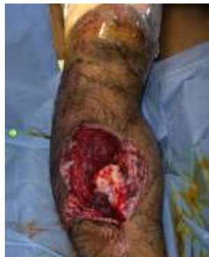
(B) Initial wound