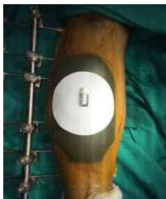
(D) Placement of connecting clamp