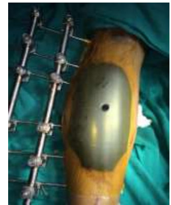
(C) Sealing with adhesive drape and opening for connecting tube