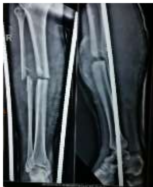
(A) Pre-op X-Ray