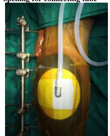
(F) Connecting suction tube