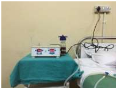
(G) Connection to negative suction pump (E-VAC system)

Following 1 st dressing after 5 days of skin grafting/flap cover, patients were discharged and were followed up regularly at 2 weeks, 6 weeks, 12 weeks and then at 6 months. Results were made on the basis of the analysis of following between the two groups:-