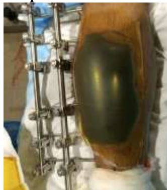
(B) Application of open-pore polyurethane foam