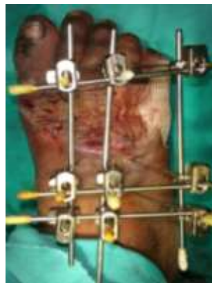
(H) After skin grafting