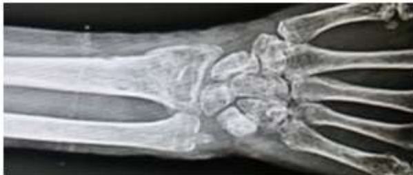
AP & Lateral (12 weeks post op)