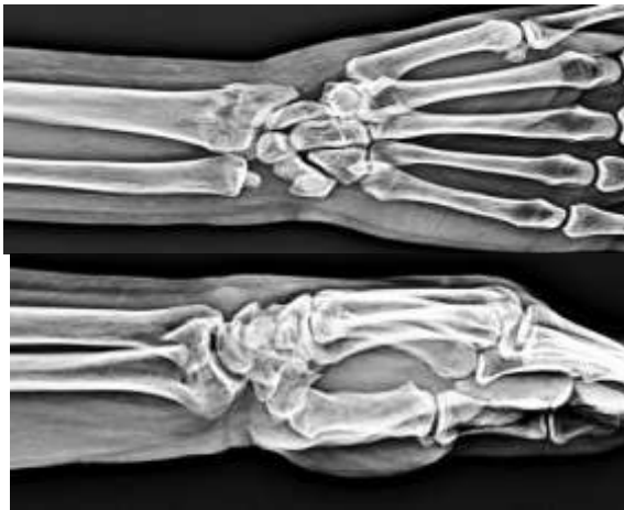
Pre-operative X-ray: AP & Lateral (48yr/m)