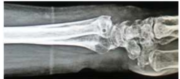
AP & Lateral (12 weeks post op)