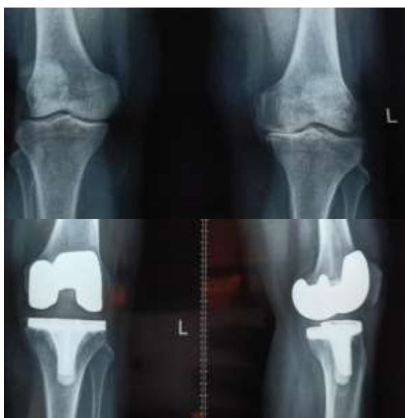
Fig. 2: Showing pre and post-operative x-ray of the same patient