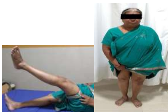
Fig. 1: At 6 months follow-up after TKR