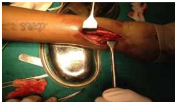
Fig. 3: Distal end radius fracture operated with buttress plate under LOP