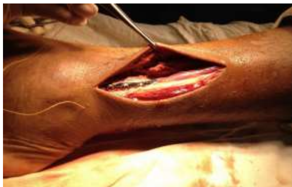
Fig. 4: Bimalleolar fracture operated with fibula (plate and screw) medial malleoli CC screw under LOP