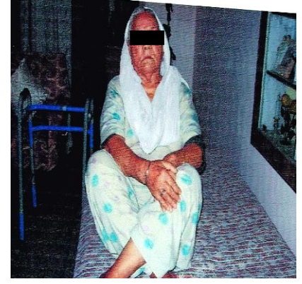
Patient showing flexion –Patient showing full weight bearing Patient showing sitting and adduction