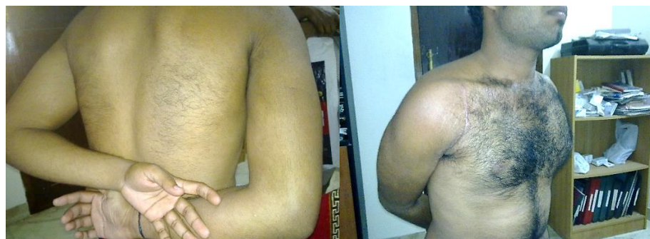
Fig. 3, 4: Post operative internal rotation