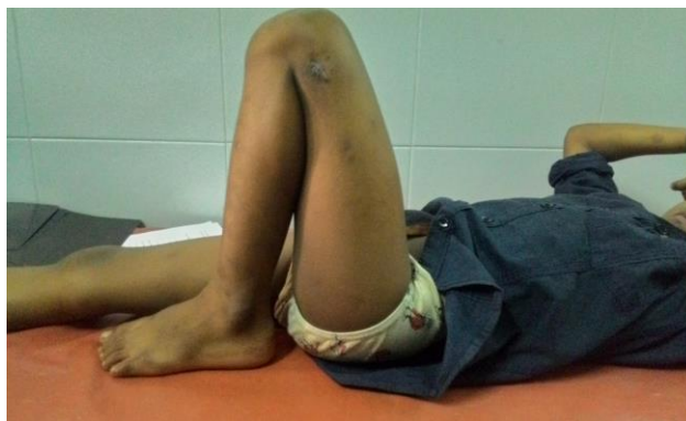
Fig. 3: United case show full knee flexion