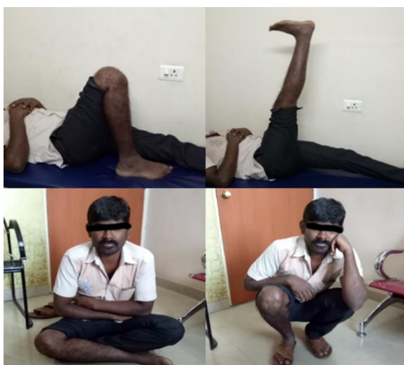
Fig. 4: Clinical photograph of Operated ACL Avulsion patient after one year follow up