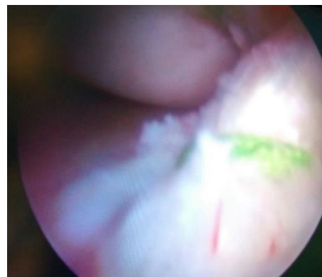
Fig. 2: Fiber wire securing ACL close to avulsion and in to tibial tunnel