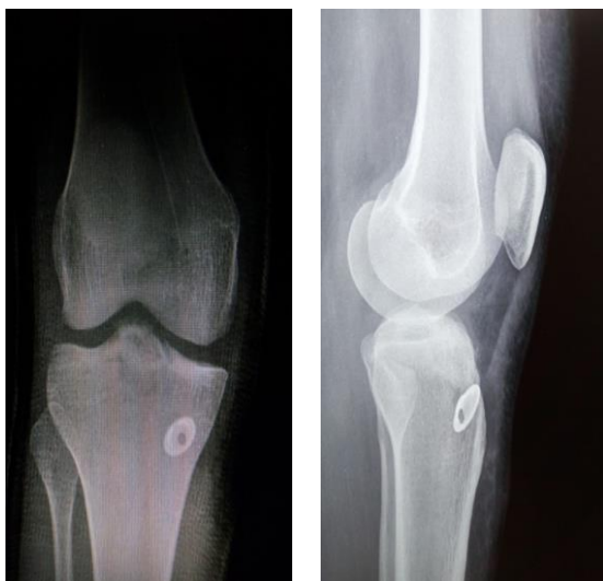
Fig. 3: Post-operative antero-posterior and lateral X-rays showing fixed ACL avulsion fragment with suture pullout in to suture disk