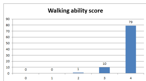
Fig. 2: Walking ability score

There were 4 cases with a varus angulation and 3 with valgus angulation at the fracture site which were less than 5 degrees. The angulations were noted at the immediate post-operative radiograph and did not show any increase in the angulation at the subsequent follow ups, till the fracture union. But there were no cases with clinical angulation at the fracture site as measured at the immediate post-operative period, subsequent follow ups till complete fracture union. There were no cases with rotational mal-alignment or any limb length discrepancy.