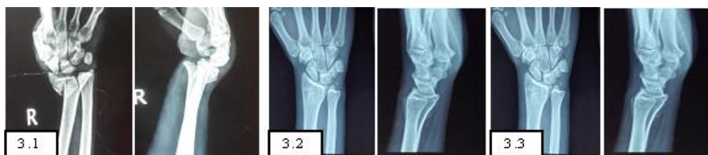
Fig 3.1: Preopxray