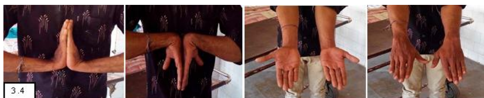
Fig 3.4: Clinical photographs