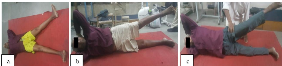
Fig 3: (a): Immediate post op. grade 2' (b): At 6 weeks grade 3; (c): At 6 months Grade