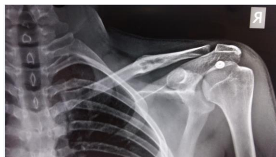
Fig. 6: After healing