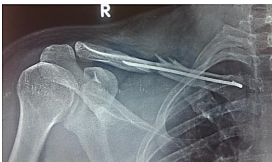
Fig. 2: Post operative x-ray