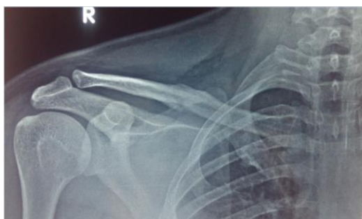
Fig. 3: After implant removal