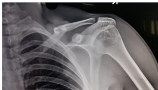
Fig. 4: Pre-op x-ray