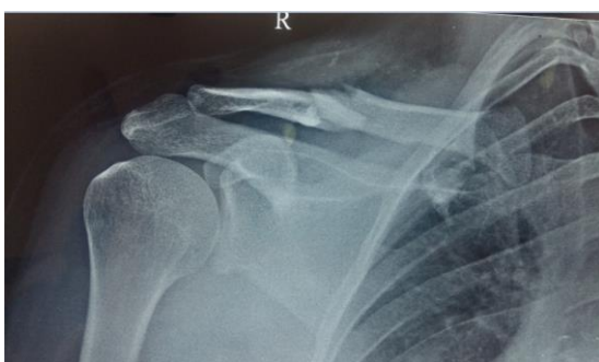
Fig. 1: Pre operative x-ray

All implants were removed under local anesthesia as a day care surgery. The average clavicle shortening was 6 mm (3mm to 14 mm), and more shortening was observed in fractures with comminution.