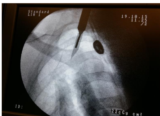
Fig. 7: Intra operative flourescopy showing entry site for the nail.