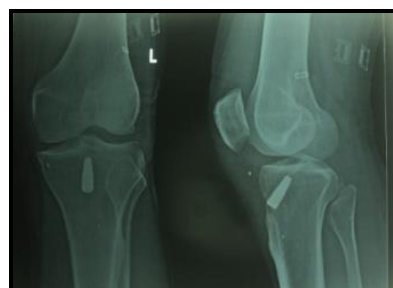
Fig. 4: Post operative X-ray showing endobutton and interference screw

Antibiotics and analgesics were given to the patient till the time of suture removal. Sutures/staples were removed after the 10th post operative day depending on wound condition. ROM knee brace was given post operatively. Patients were followed post operatively at 6,10 and 14 weeks thereafter every 3 months up to 1 year.