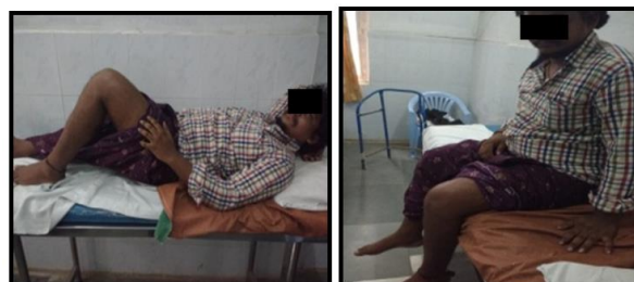
Fig. 5: Hip range of movements

At follow up detailed clinical examination was done and patients were assessed subjectively for pain, laxity of knee and range of movements (Fig. 5).