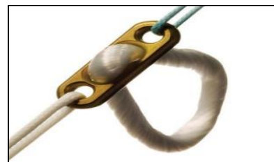
Fig. 3: Endobutton.

using femoral reamer depending on graft size. Tibial entry made using tibial jig with 55° angle and tibial tunnel reamed with tibial reamer. After measuring femoral tunnel length, concerned size of endobutton (Fig. 3) attached to graft and tendon passed from tibial tunnel to femoral tunnel. Endobutton flipped and graft cycling done. Tibial tunnel fixed with titanium interference screw. In some cases on both sides titanium interference screw used depending on affordability for endobutton. Intraoperatively graft tightness was checked and found satisfactory. Compression bandage applied after deflating tourniquet. Post operatively position of screw confirmed on x-ray knee joint (Fig. 4)