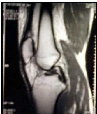
Fig. 1: MRI showing complete ACL tear

no previous surgeries to the concerned knee. Patients above 45 years and below 15 years of age, patients with comorbid conditions and medically not fit for anesthesia, patients associated with fractures around knee and other ligament injuries and patients with generalized ligamentous laxity were excluded from study. All the patients who came to orthopaedic OPD were examined to confirm laxity of knee joint and to rule out any associated injuries. All the patients were subjected for X-rays which includes X-ray knee joint with antero posterior and lateral views to rule out any tibial spine avulsion and clinical diagnosis was confirmed with MRI scan of concerned knee (Fig. 1)