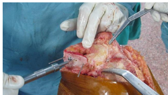
Fig. 5: Intra operative defective repair with grafting on the medial side of tibia