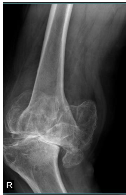
Fig. 10: X-ray of the patient AP view of Right knee