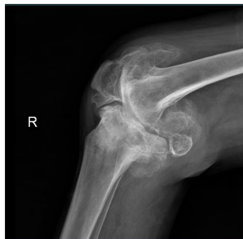
Fig. 11: X-ray of the patient lateral view Right side