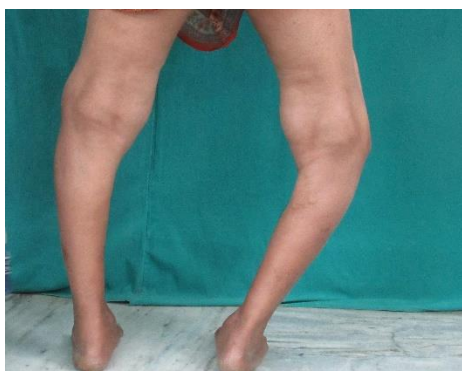
Fig. 9: Photograph of the patient standing from the back planned for Right TKR