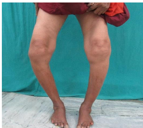
Fig. 7: Photograph of patient in standing position from the front planned for Right TKR