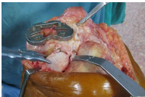
Fig. 6: Intra operative defective medial side of tibia and posterior big osteophyte which is being removal