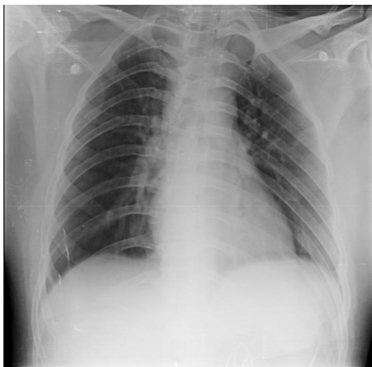
Fig. 2: Chest X-Ray of male patient taken immediately after the complaint of Breathless showing Oligoemia (PE) (decreased vascular marking) over right lower lobe of lung