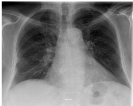
Fig. 3: Male patient which shows wedge shaped infarct area over the same zone of lung (progressed lesion)