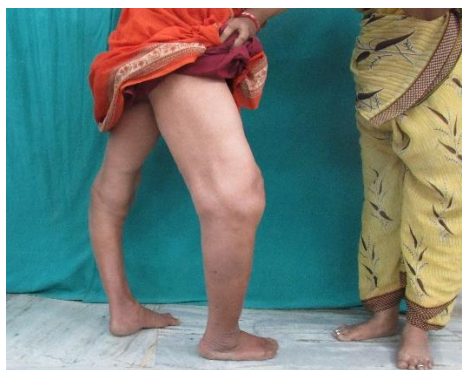
Fig. 8: Photograph of the patient in standing from the lateral side of patient planned Rt TKR