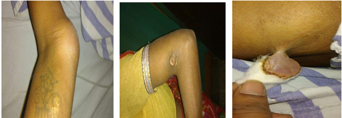
Fig. 2: Musculoskeletal swelling of forearm