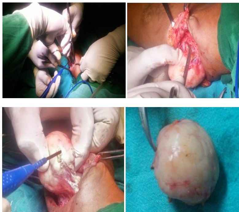
Fig. 5: Excised cutaneous mass from right forearm