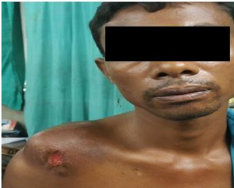
Fig. 10: Clinical picture of swelling over right shoulder

Histopathological examination of the lesion revealed many sporangia & spores with presence of lymphocytes and multinucleated giant cell. PAS stained smear showed many sporangia and spores along with giant cell suggestive of rhinosporidiosis. Isolated involvement of clavicle bone is rare in rhinosporidiosis. Dapsone is the drug in the doses of 100 mg OD for 6 months that is regarded as useful for treating rhinosporidiosis.