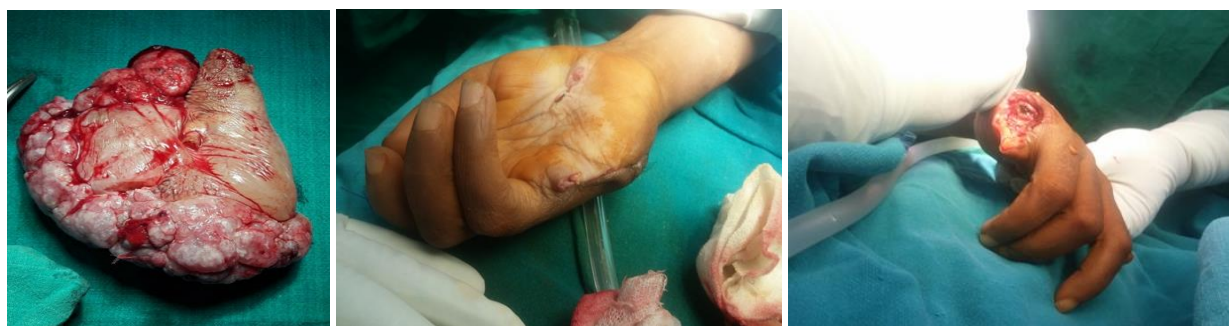
Fig. 6: Excised fungating mass along with right little finger from right hand