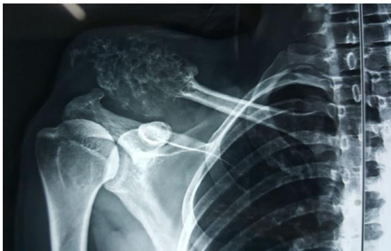
Fig. 11: Radiograph showing destruction involving the of the right clavicle