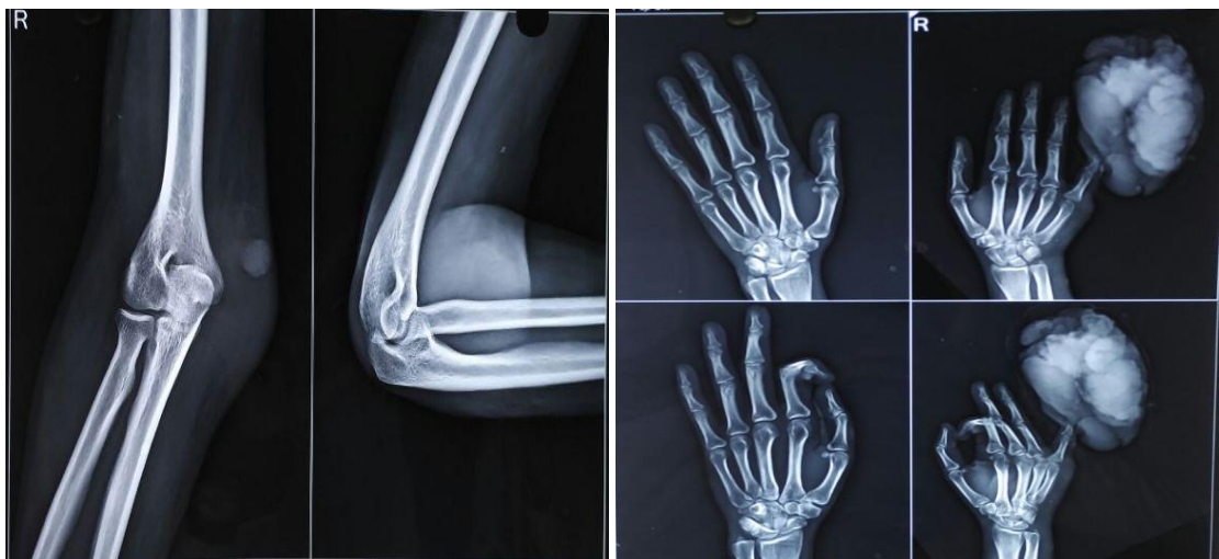
Fig. 4: Radiograph showing osseous involvement and soft tissue shadow